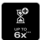
Up to 6 times longer lifetime 2)

The NIGHT BREAKER LED family - OSRAM's first street-legal 1) LED retrofit lamps.