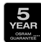
5 Year OSRAM Guarantee 4)

Vibration resistant, environmentally friendly, cost-efficient and validated according to the ingress protection class IP54.