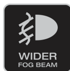
Wider Fog Beam 3) & 6000K

See and be seen with OSRAM. Cool white color temperature similar to daylight. For more safety on the road, especially when driving at night and in adverse weather conditions.